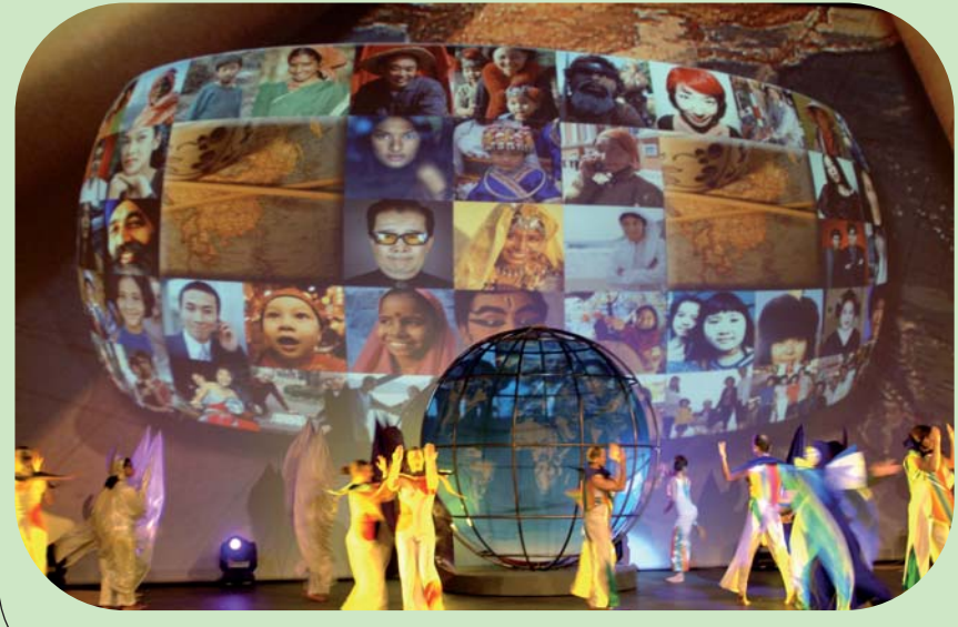
Founding Congress in Paris - May 2004