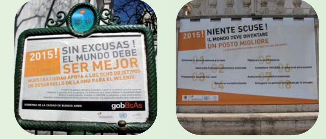
MDGs Campaign: Paris - Buenos Aires - Rome