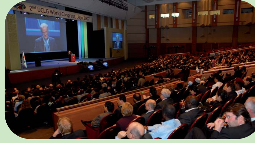
Congress in Jeju - October 2007

government closest to the citizens and reforming credit mechanisms and financial tools to enhance local governments' access to borrowing.