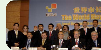
World Council in Beijing - June 2005

The first Committees and Working groups of UCLG were established and opened the door for cities, local governments and their associations. Today, over 18 different topics are covered by the Committees and Working Groups.