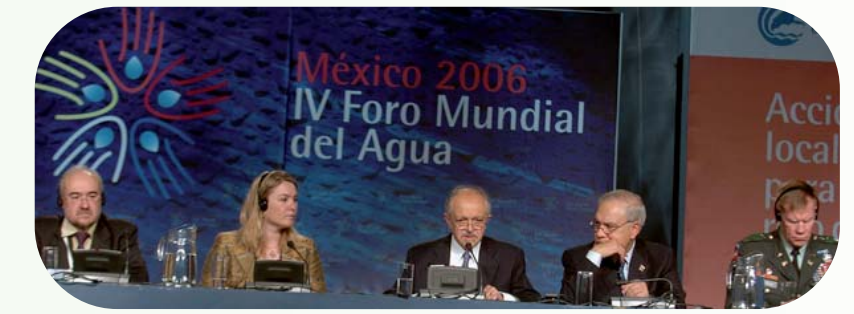
World Water Forum in Mexico

Governments of the world acknowledged that local authorities play a major role in delivering a sustainable access to water and to sanitation services, and in supporting integrated water resource management. The Declaration of the Local Governments of UCLG was included in the final declaration of the World Forum on Water in March 2006.