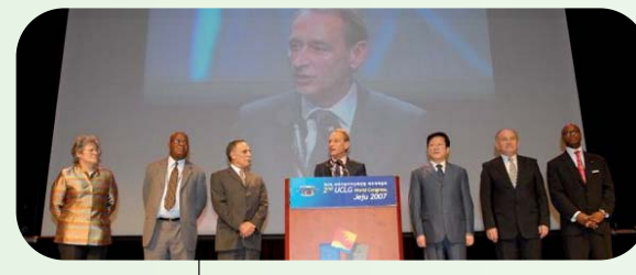
Presidency in Jeju

UCLG constituted the first ever comprehensive study project on the state of decentralisation by setting up the Global Observatory on Local Democracy and Decentralisation (GOLD) . The report put an emphasis on the contemporary situation of local governments in all regions of the world and demonstrated the progress of local autonomy throughout the world during the two previous decades.