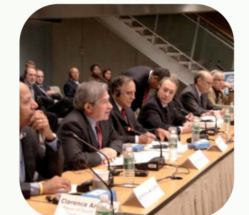
Meeting with the World Bank - Executive Bureau in Washington - February 2006

At the UCLG Executive Bureau meetings in Washington, the World Bank President Paul Wolfowitz expressed the interest of the World Bank in strengthening relations with UCLG and committed to developing new instruments to support city development.