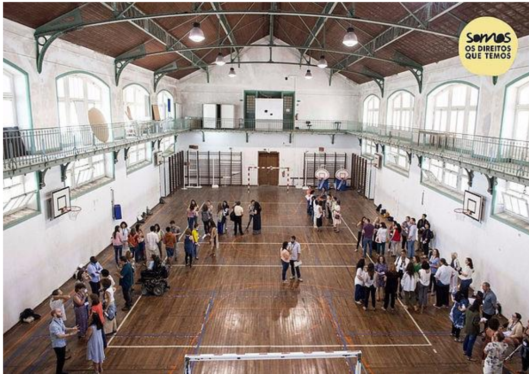
Figure 2- A joint session of the III SOMOS School, at Camões Secondary School, July 2017. In SOMOS, n.d., Retrieved July 15, 2017, from http://www.programasomos.pt/single-post/2017/07/11/III-Escola-SOMOS-O-que-%C3%A9-uma-escola-de-ativismo-1 . Copyright 2017 by Municipality of Lisbon. Reprinted with permission.